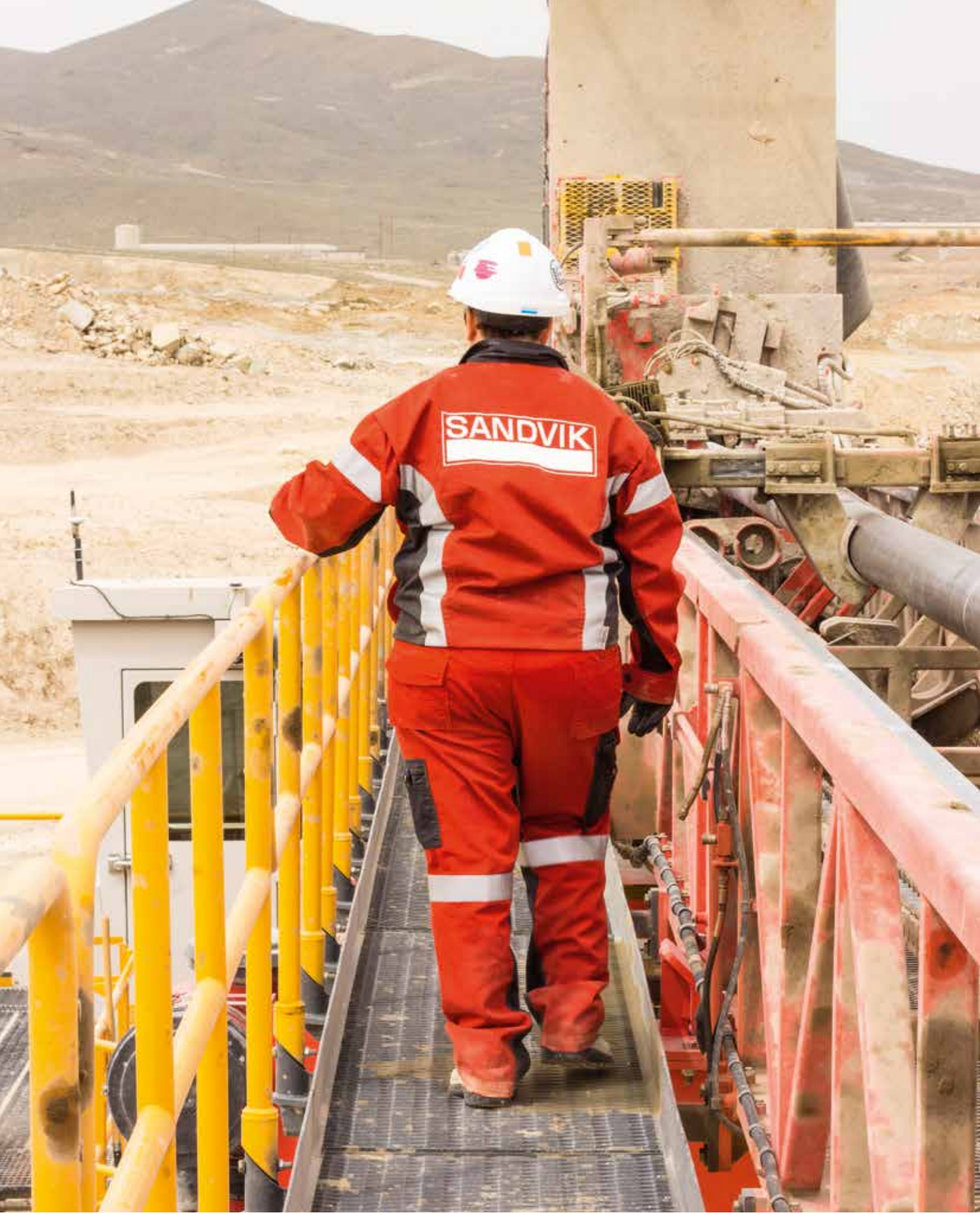
Sandvik DR461i includes more walkways for better serviceability and access with open serrated grip strut material. We've laid the grating in the direction of foot traffic to enable mud to fall through.